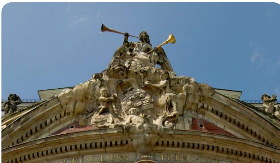
The castle of Münster: main building of the University